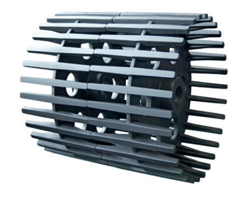
Several grating pulleys are designed as a unit on a shaft crowned or spherical shape. The multi-part design facilitates assembly