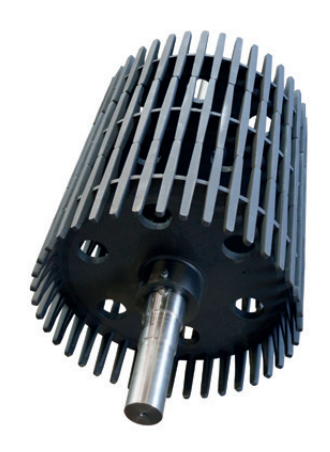
The delivery is also available as a readyassembled assembly including a precisely fitting shaft to minimise the assembly effort and reduces the costs.