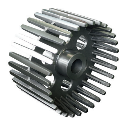
Pre-produced blanks are available up to up to a diameter of 630 mm are available from stock and can be delivered at short notice.

Individual geometry selection due to a high number of variants