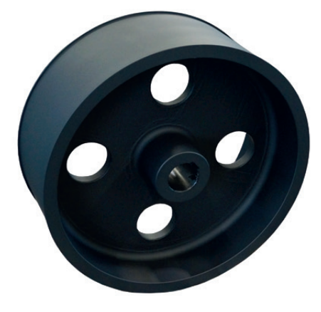
Crowned or spherical design of the surface. Optionally with belt guidance ribs on the outer edges.