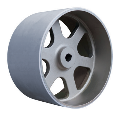
Belt disc with galvanically nickel-plated surface for use in the food processing industry.